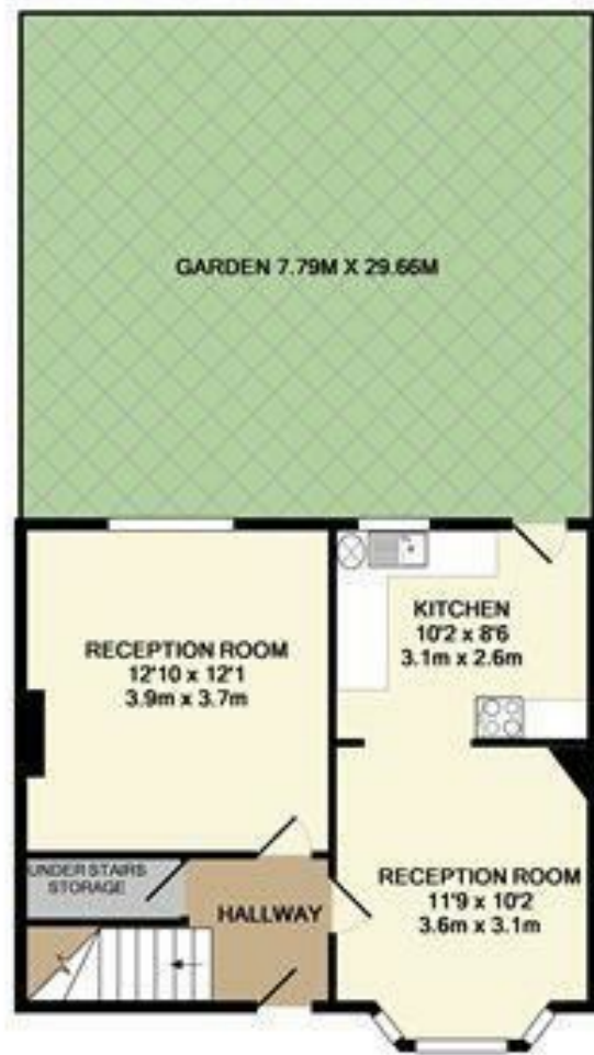
GROUND FLOOR APPROX. FLOOR AREA 421 SQ.FT. (39.1 SQ.M.)